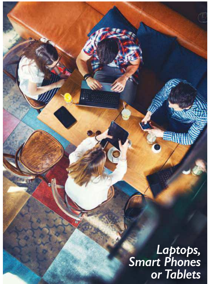
Laptops, Smart Phones or Tablets